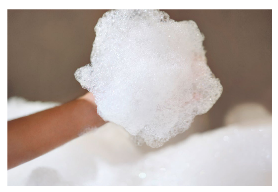
Insights into the new bathing experience can be found in the video.