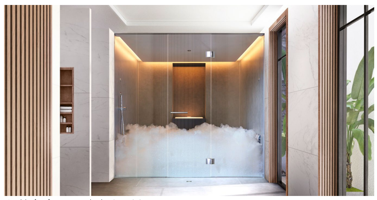
World's first foam steam bath ESPURO®

As with all KLAFS products for hotels, spas and public facilities, attributes such as a smooth bathing process, the lowest possible energy consumption and minimal cleaning effort are of primary importance to KLAFS. In the case of the new ESPURO® foam steam bath, the latter was worked out together with the recognized hygiene laboratory WHU GmbH (Water, Hygiene, Environment) and Dipl. Ing. Dr. Arno Sorger. The hygiene concept, which has been verified by an expert opinion, guarantees optimum and efficient cleaning after each bathing session. Within the shortest possible time, the foam is degassed by special nozzles and does not reach the area in front of the steam bath. All water-bearing pipes are rinsed and disinfected at the touch of a button. Thanks to this sophisticated cleaning and hygiene concept, not only does every guest feel safe and completely at ease, but the experience in the foam is also completely worry-free for the operators of the facility.